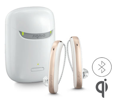
Solution: Styletto X

Rechargeable, patient preferred* SLIM-RIC